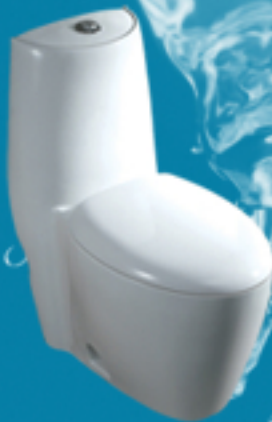
Nile ECO Friendly Dual Flush Toilet