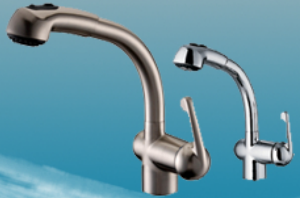
K611BN & K611CP