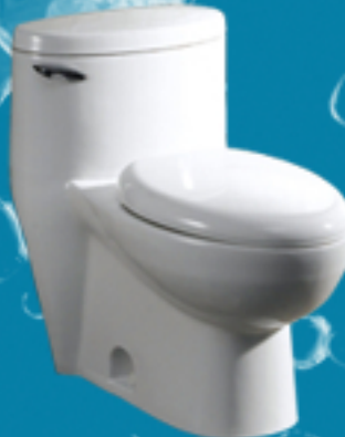
Hudson High Efficiency Single Flush Toilet