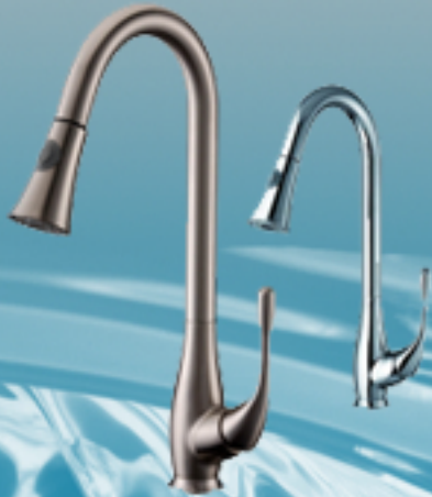
K054BN & K054CP