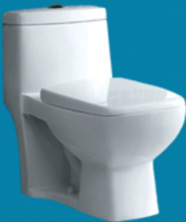
Potomac ECO Friendly Dual Flush Toilet