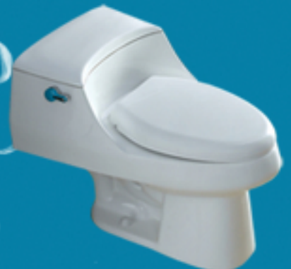
Yukon High Efficiency Single Flush Toilet