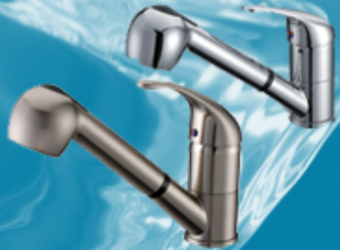
K127BN & K127CP