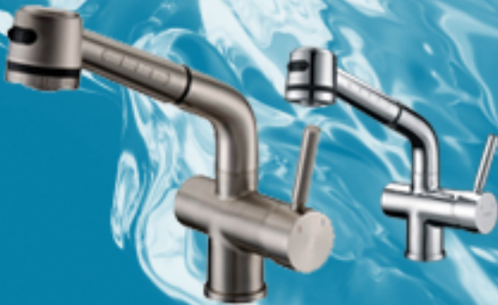
K612BN & K612CP